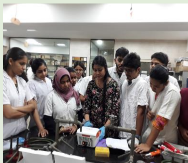
Workshops, Industrial Visits