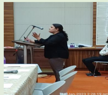
Seminar, Outreach Activity